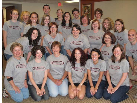
“Teachers Teaching Teachers”

Educators in all curricular areas, K-16, counselors, administrators, and professionals who want to improve their own writing and writing in schools.